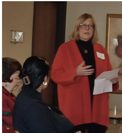
Dressed in red and other vibrant colors, branch members learned about the possibility of creating an endowed scholarship for a UMR student.